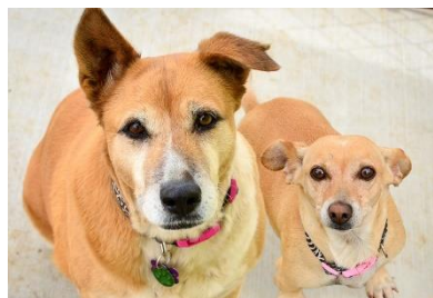
Gracie & Candy

Hi, we're bonded pals Gracie, 12 yr old Shepherd & Candy, 7 yr old Dachshund. I'm Gracie, a beautiful, young at heart, affectionate, & I consider everyone a friend. Candy is a keen listener, gentle with her affection, & doesn't sweat the small stuff as she is quiet as can be. Together we are a laid back & perfect companions to a long peaceful stroll, or absolute lap dogs for those times you want to stay in & enjoy home!